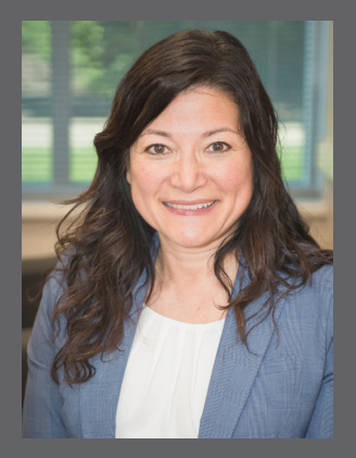
Roberta Jorgensen Puntillo Godin Geraghty Puntillo Camilli & Hughes, S.C.