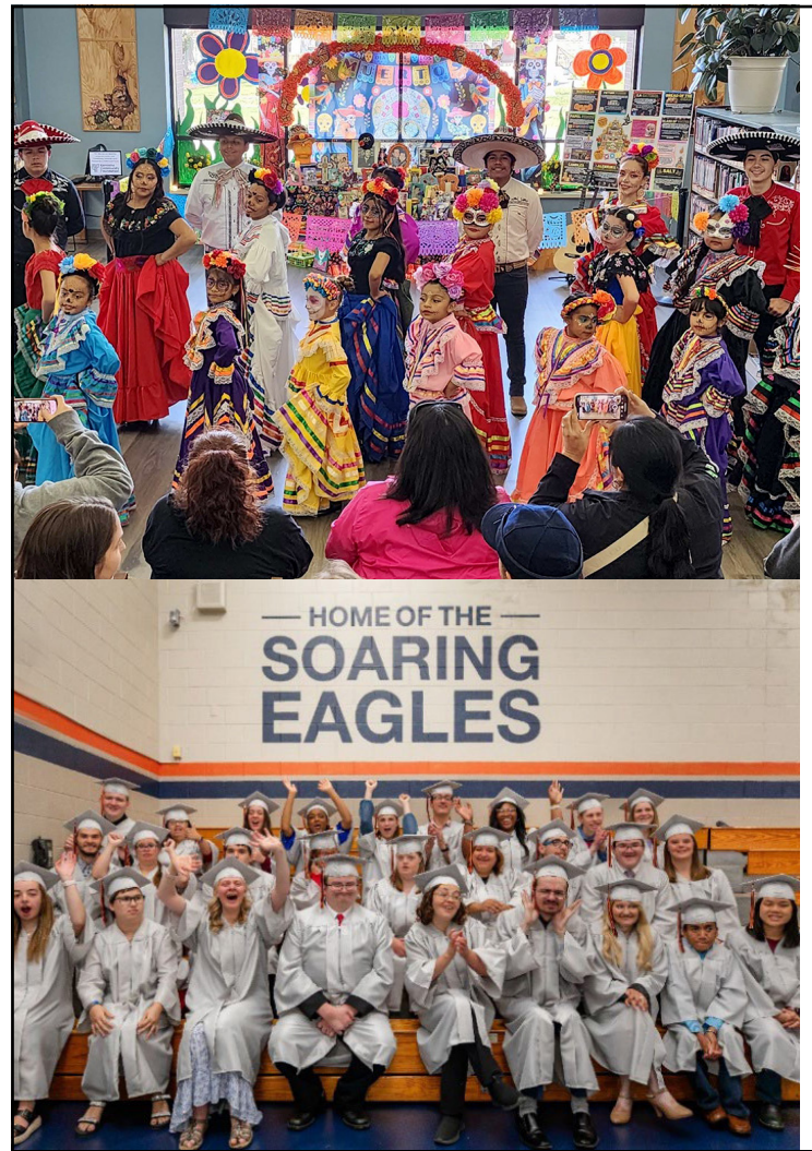
Pictured above: Kenosha Public Library's Dia De Los Muertos cultural program series and graduates of Shepherd's College class of 2024.

**Denotes the portion of KCF's pooled investments that remain assets of partner nonprofits